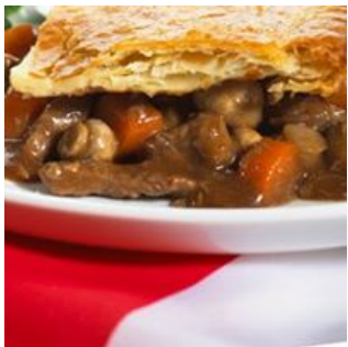
Classic Main Courses & Sharing Platters